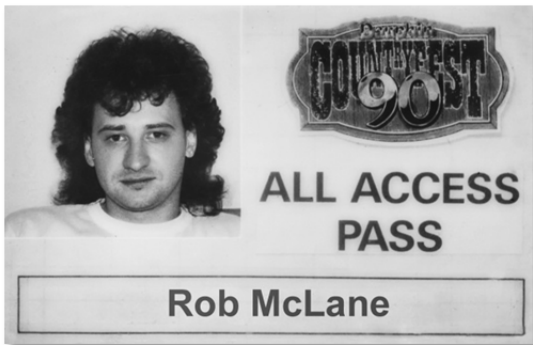
DAUPHIN COUNTRYFEST ENTERTAINER'S STAGE ACCESS PASS