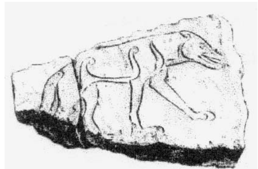
Pictish Wolf—based on Ardross Stone housed, Inverness Museum & Art Gallery

From Edmonton: take your best route to Stony Plain Road, follow it west from the city. Turn left onto highway 60; follow above directions.