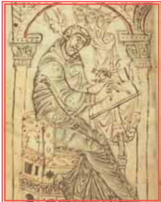
This illumination from a medieval manuscript depicts the Venerable Bede at work in the scriptorium, while a bird whispers something into his ear.