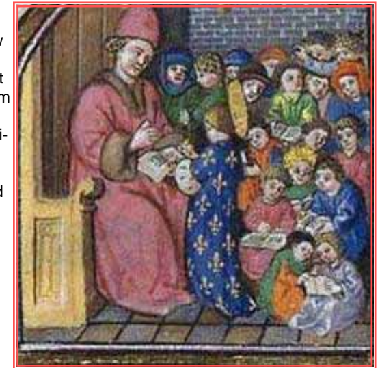
Une école bondée Heures de Louis de Savoie, vers 1450 Paris, BnF, département des Manuscrits, Latin 9473, fol. 172