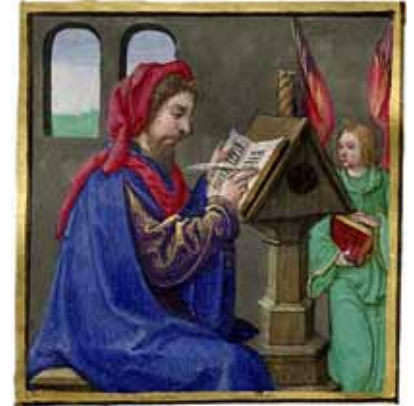
Book of Hours, Ms. Library of Congress. Rosenwald ms. 10" (1533)