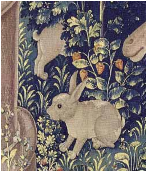
The Unicorn Is Found (detail from Unicorn Tapestry), ca. 1495–1505

Verdun, 1300-1350 , Bréviaire de Renaud de Bar. Metz, (Verdun, B.m., ms. 0107, f. 089, 107).