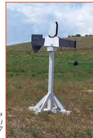
Pictures by Beothuk of the Beothuks Quintain (jousting dummy) from Quad War 2007