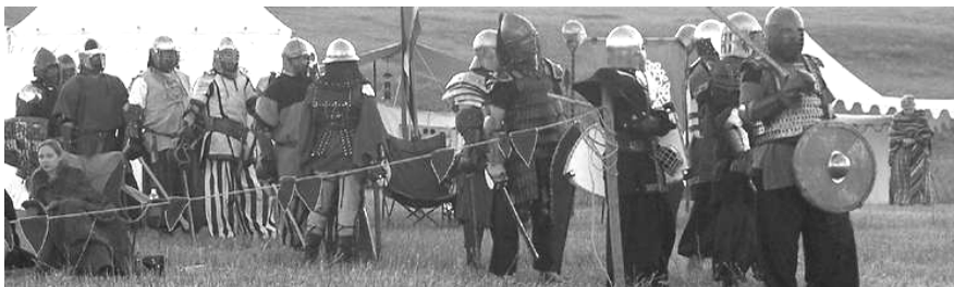
Queuing up for the tourney at Quad