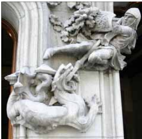
St. George and the Dragon — Barcelona