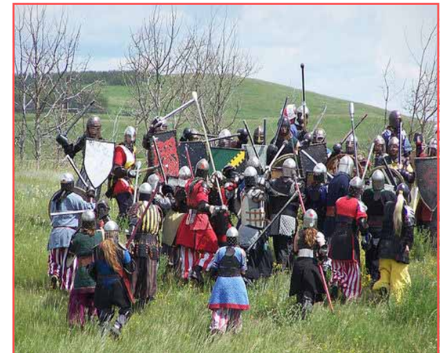
Clash of arms during the field battle at Avacal Quad War 2005 — Picture by Beothuk

From the E and SE: Make your best route to Saskatoon. Take HWY 16 to North Battleford. As you cross the bridge, stay to the left on HWY 40. It will turn west (right) midway through town. 5km west of (past) Marsden turn north (right) on Artland road The site is 4.5 km on the west (left).