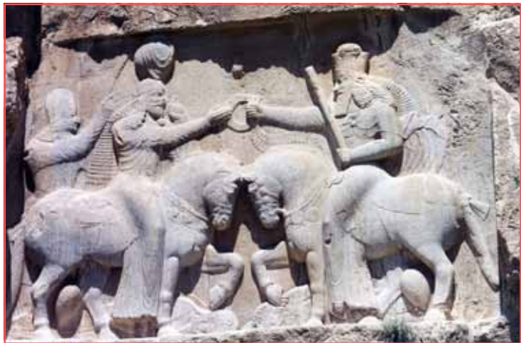
Image:Naqsh i Rustam. Investiture d'Ardashir

***Signs will be posted starting at Hwy 2A***