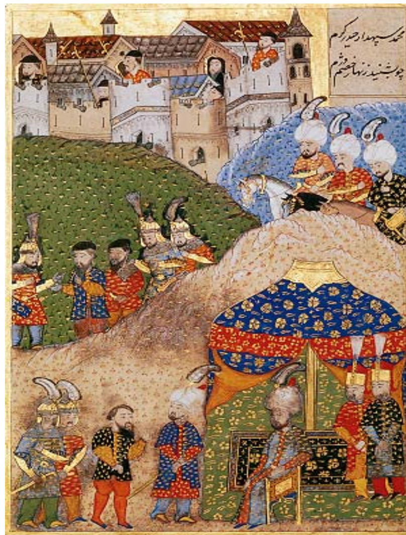
An illustration from The Book of Worthy Conquest , which narrates the conquest of four Hungarian towns, a campaign led by Sokollu Mehmed Pasha in 1551