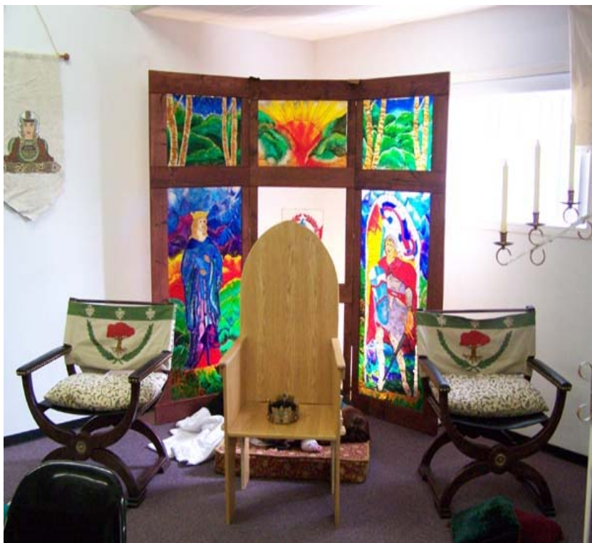
Stained Glass backdrop done by a few folks in Rhuddglyn.

PS. Happy Leif Eriksson Day (Oct 9th. at least in the US)