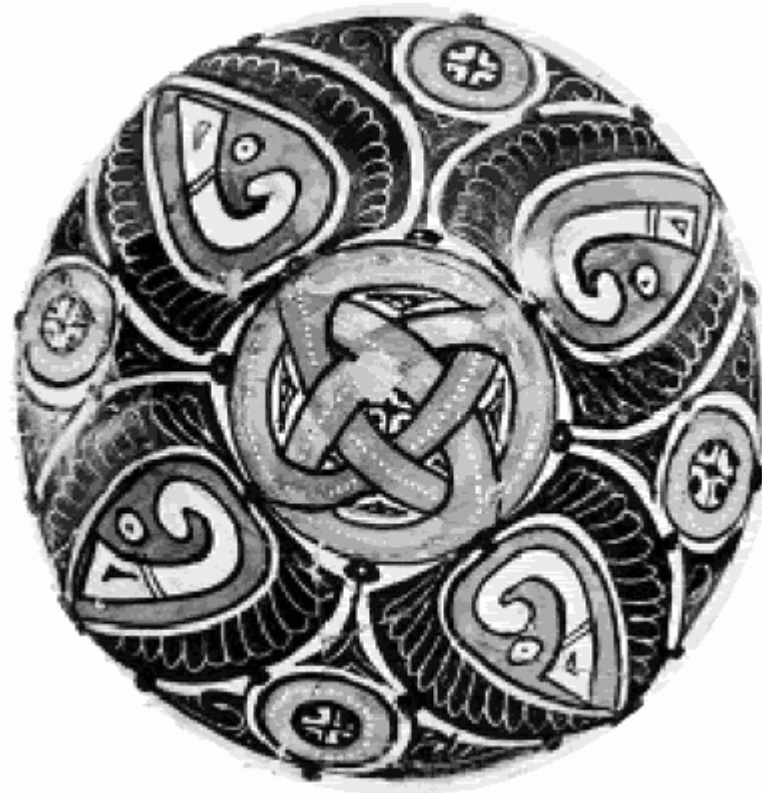
Plate, Nishapur. Glazed ware (tenth–eleventh century).

In the Reign of Their Highnesses Vik and Inga