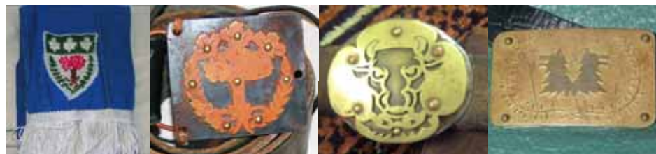
From Left—Myrgan Wood Gallant's Scarf and Sargeant's Belt, Montengarde Sargeant's Belt, and Borealis Sargeant's Belt

...In Service to the Dream—HL Bjar the Blue, Sergeant-Gallant of Montengarde